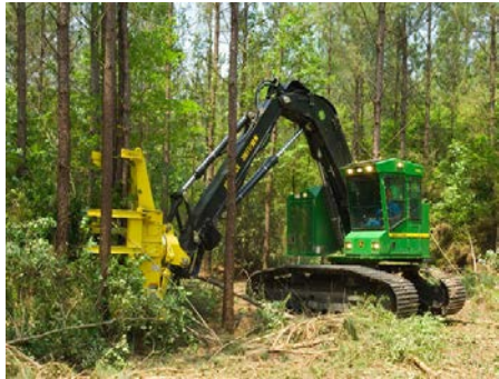
FIGURE 2: MECHANIZED EQUIPMENT USED TO FELL, SKID 8 , CHIP AND TRANSPORT P-J BIOMASS

→ Tracked Feller Buncher – This piece of equipment operates on tracks to minimize soil impacts. It fells the trees to be harvested and then accumulates the felled trees into bunches. Typically, each bunch consists of about 8 trees.