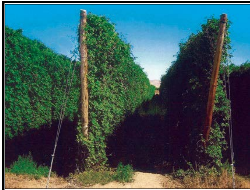
FIGURE 1: PEELED JUNIPER POSTS USED IN AN AGRICULTURAL SETTING

It appears that this mill has had some modest success in producing and marketing products from Western juniper since its inception a few years ago. However, this appears to be due to the financial support of local industry and other benefactors. It is unclear if the Utah juniper (due to its smaller size) could support the manufacture of similar products such as sawn 6" x 6" posts for vineyards or other applications. Another important factor in this operation is that there is a well established forest products industry in the area that provides timber felling resources and ready markets for the wood waste produced by the mill. Due to the characteristic knotting and twisting of Juniper logs, a large percentage of the timber brought to the plant ends up as waste. Finally, JMAR is strategically located with good access to the growing wine industry in northern California and Southern Oregon.